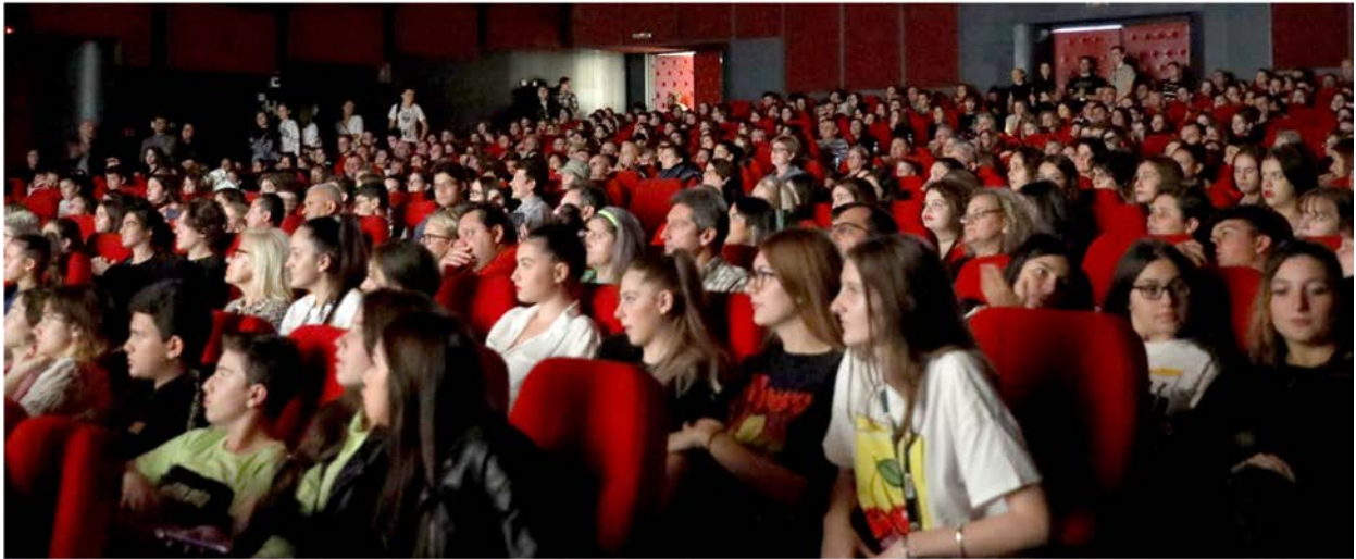
The participants of the workshop for painting and photography set up an exhibition in the lobby in the Millennium Cinema.

At the closing ceremony, the audience had the opportunity to see the results and the performances prepared by the young participants during the five festival days, in the nine workshops. The winning films in each of the age categories were also announced. At the end, the presenters revealed the names of the first two representatives, selected among the most active participants in the seventh edition, who will represent us in the international jury in Italy at Giffoni Experience 2020.