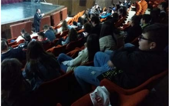
In all four dates, two feature films were screened, followed by discussions led by a moderator who was also a mentor of the acting workshop. After the screenings, the young people participated in three workshops, acting, art and photography.