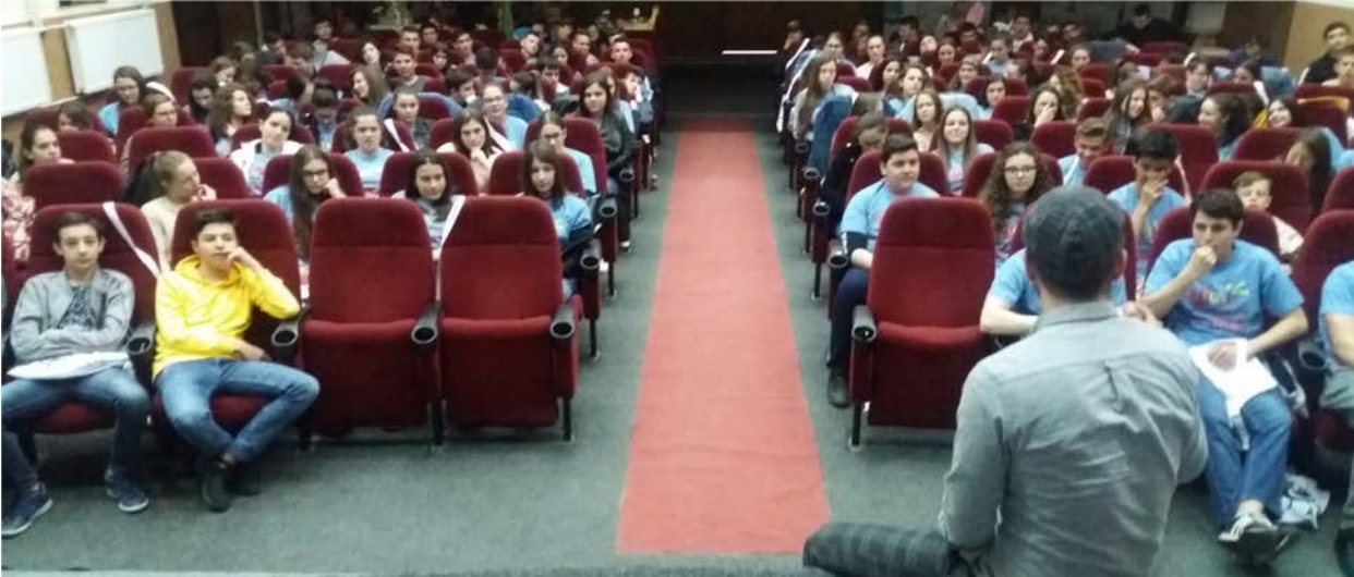
During 2019, "Giffoni on Tour" was held in Radovish, Kicevo, Gevgelija and Kavadarci as a traveling part of the festival in the smaller Macedonian towns.