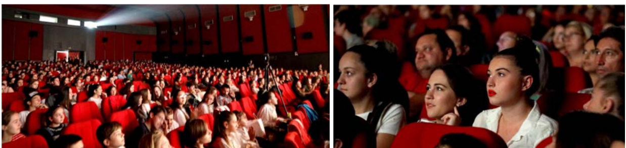
Six short feature films from the film workshop and six short animations were shown, as well as two one-take videos produced during workshops were broadcasted on the big screen.